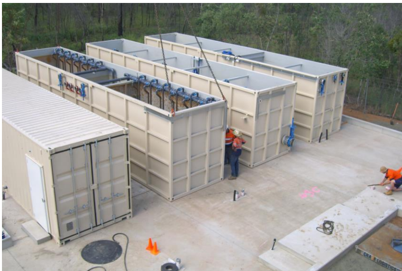
Akwa-Worx project site during installation