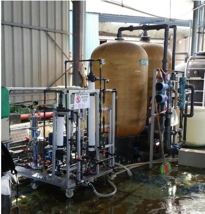
Picture: De.mem NF membrane deployed at customer site for industrial waste water treatment

De.mem began running its first commercial-scale plants using its proprietary low pressure hollow fibre nanofiltration membrane ("NF membrane") in early October [ASX Announcement: October 9, 2017]. The water treatment systems are being run as part of a pilot phase which aims to validate the new technology in various commercial scale on-site projects. The NF membrane was developed at Nanyang Technological University (NTU) in Singapore and exclusively licensed to De.mem in 2016. It aims to provide high quality treated water at relatively low energy consumption. The pilot trials are still in progress and the Company will be providing further updates soon.